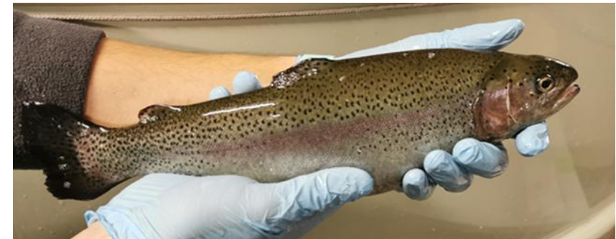
Rainbow trout ( Oncorhynchus mykiss )